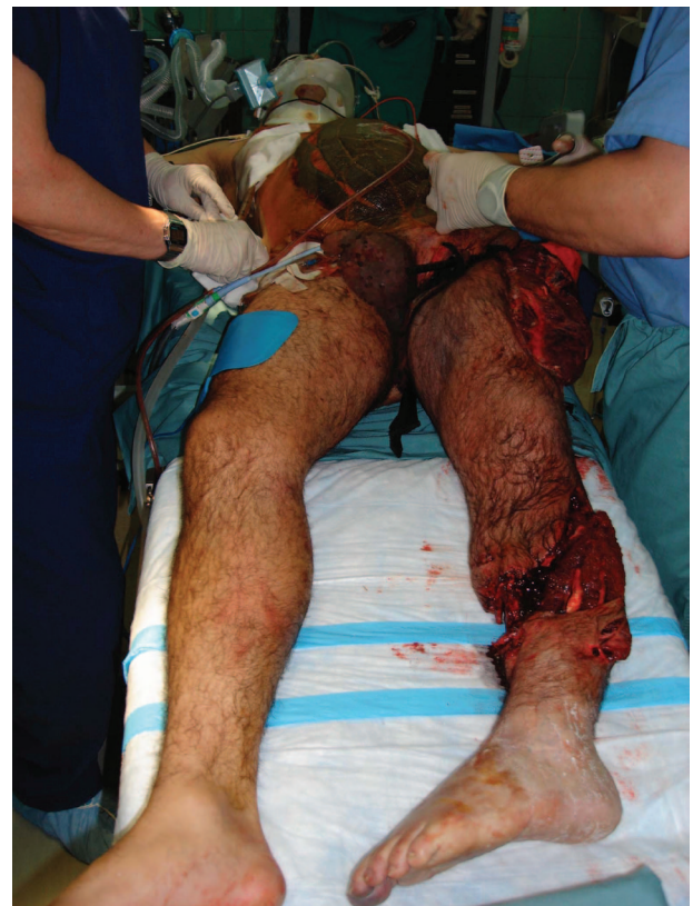
Fig. 2. Photograph of patient with multiple injuries and a tourniquet used on the thigh. The patient had a proximal femur fracture with femoral artery and vein transection and a near-complete below-knee amputation. The only left leg structures partially intact were in the deep posterior compartment. Other potentially lethal injuries required massive transfusion, emergency department thoracotomy and aortic cross clamping, open manual cardiac massage, three cardiac electroconversions, emergency laparotomy and ligation of the common iliac, femoral arteries and veins as hemorrhage control measures, and an intensive care unit respite to correct coagulopathy before the tourniquet could be attended and amputation done for the ischemic limb sequelae. This patient had a transfemoral amputation performed after 14 hours of tourniquet application. The patient survived.

428 tourniquet uses (97%). Tourniquets distal to the most proximal limb wound numbered five on four limbs in four patients; two of these four patients died. A tourniquet was placed atop the wound in another patient; this patient had the